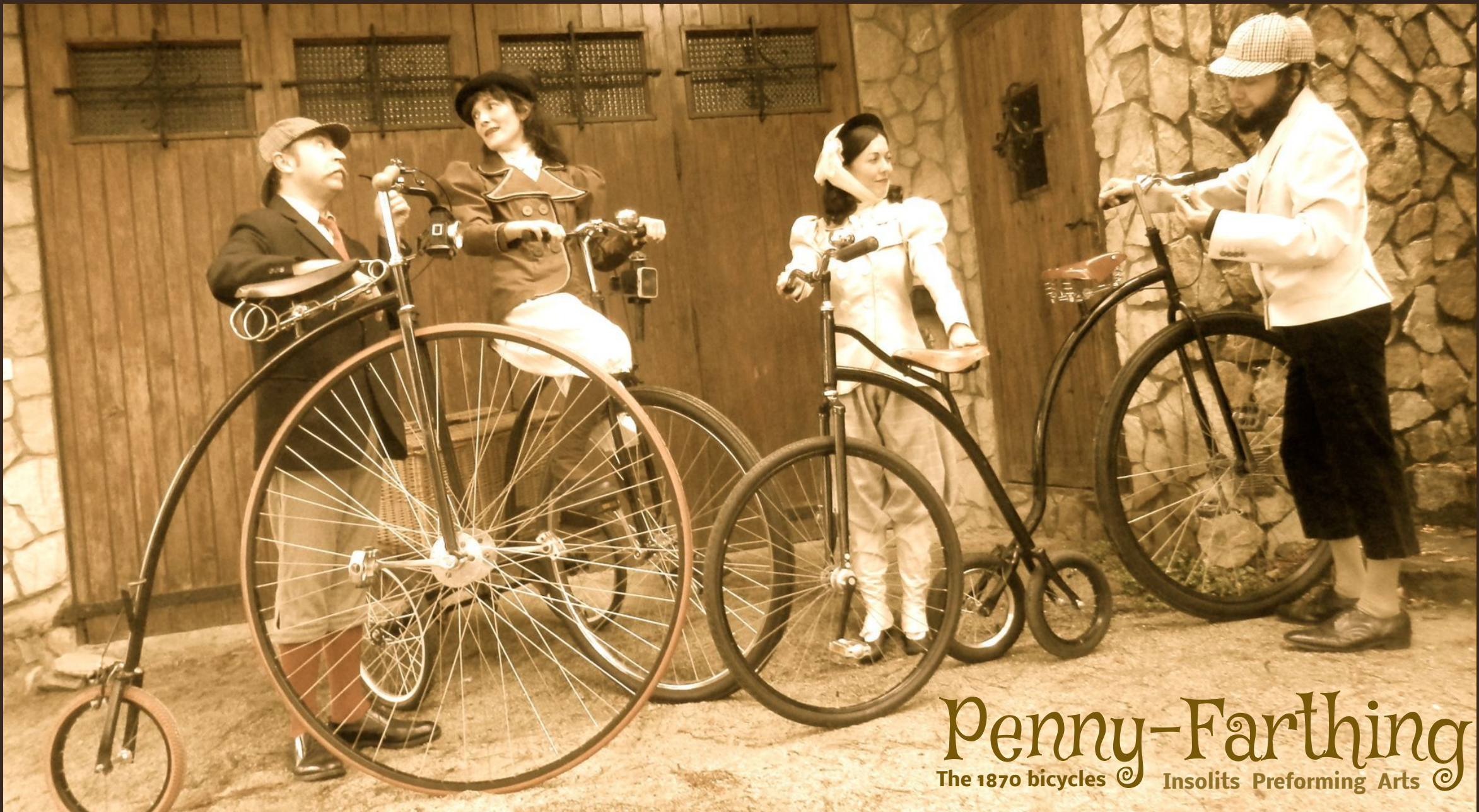
Penny-Farthing The 1870 bicycles